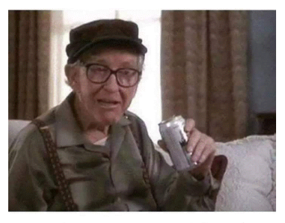
so choose something fun

Instead of a sign that says 'do not disturb' I need one that says 'already disturbed proceed with caution'